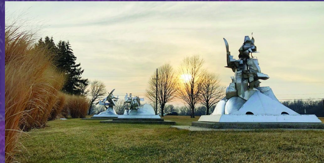
Trilogy: Growth, Development, Interaction by Richard Hunt Welded stainless steel, 1994 Funds provided by the Friends of MCC Foundation and the Illinois Arts Council Located on the grounds of MCC, Entrance One