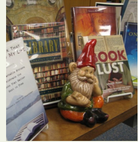
Noam N. Clayture is critically thinking about the NLW display.

a resource if you know of one we should acquire.