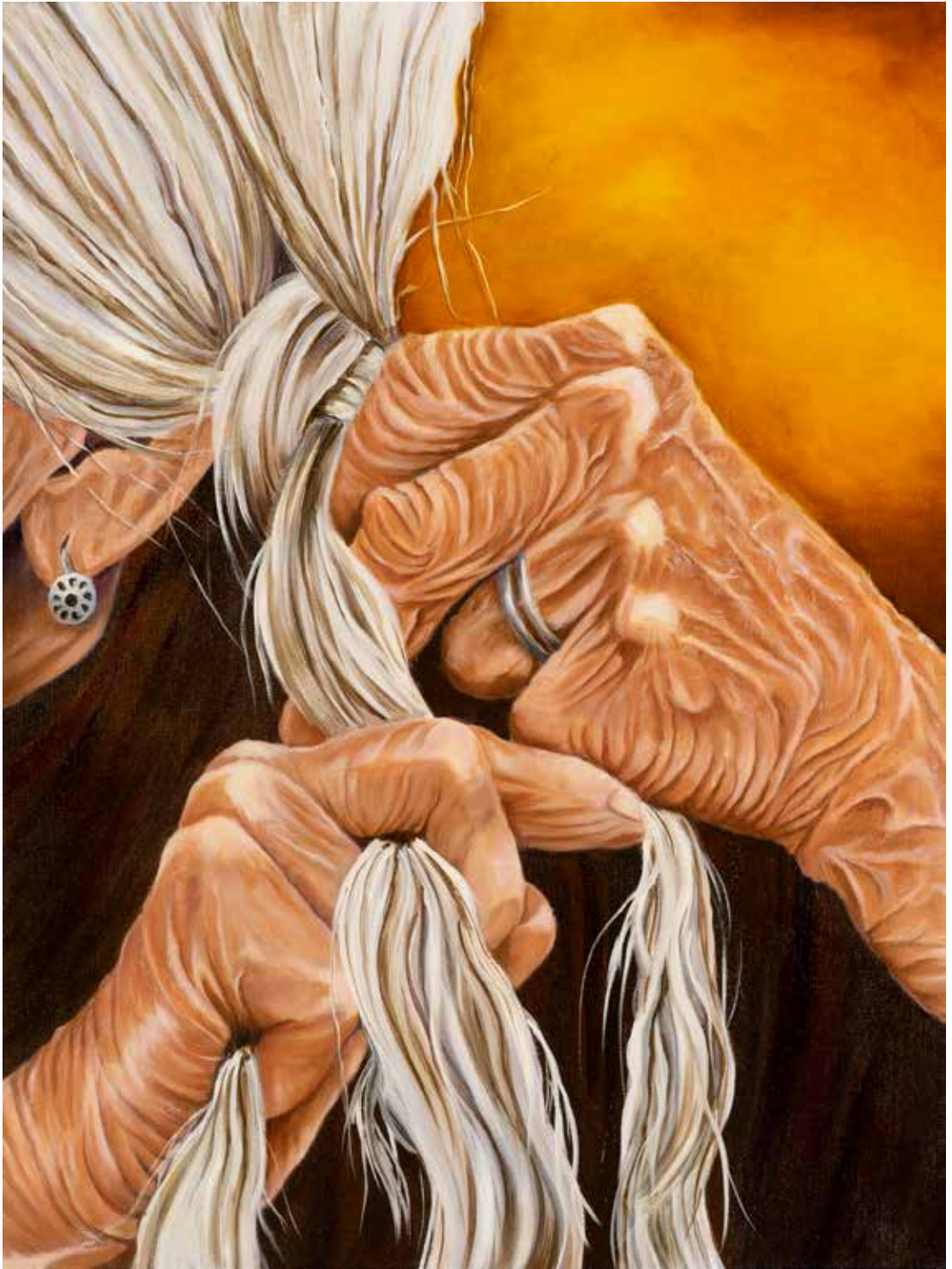
OIL ON CANVAS, 24" X 18"