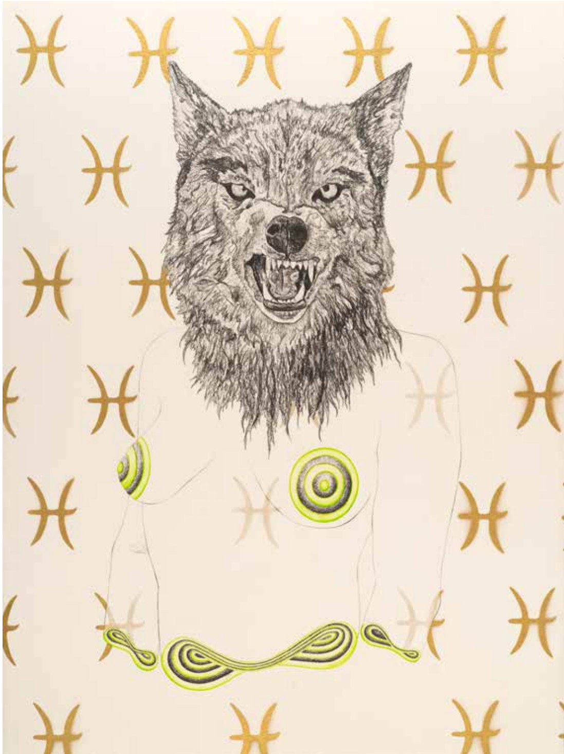
GRAPHITE, WATERCOLOR PENCIL, 30" X 22"