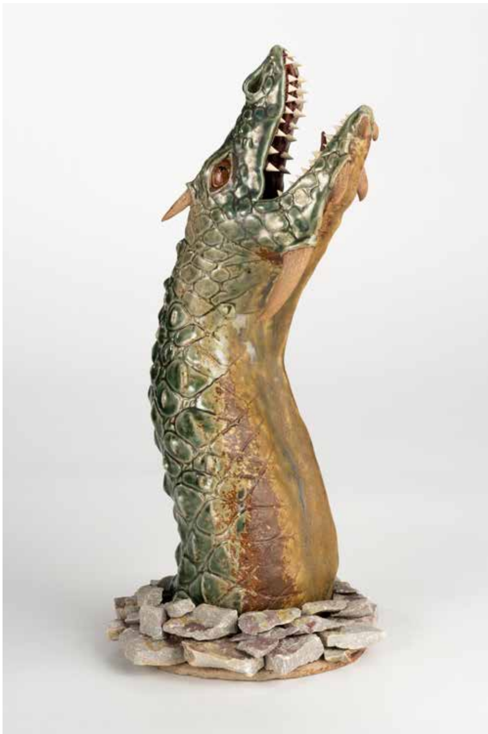
STONEWARE, 15" X 7" X 7"