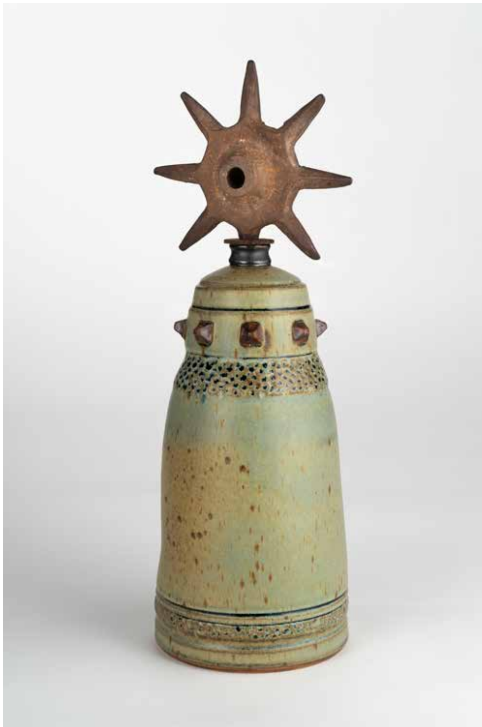
STONEWARE, 17" X 6" X 6"