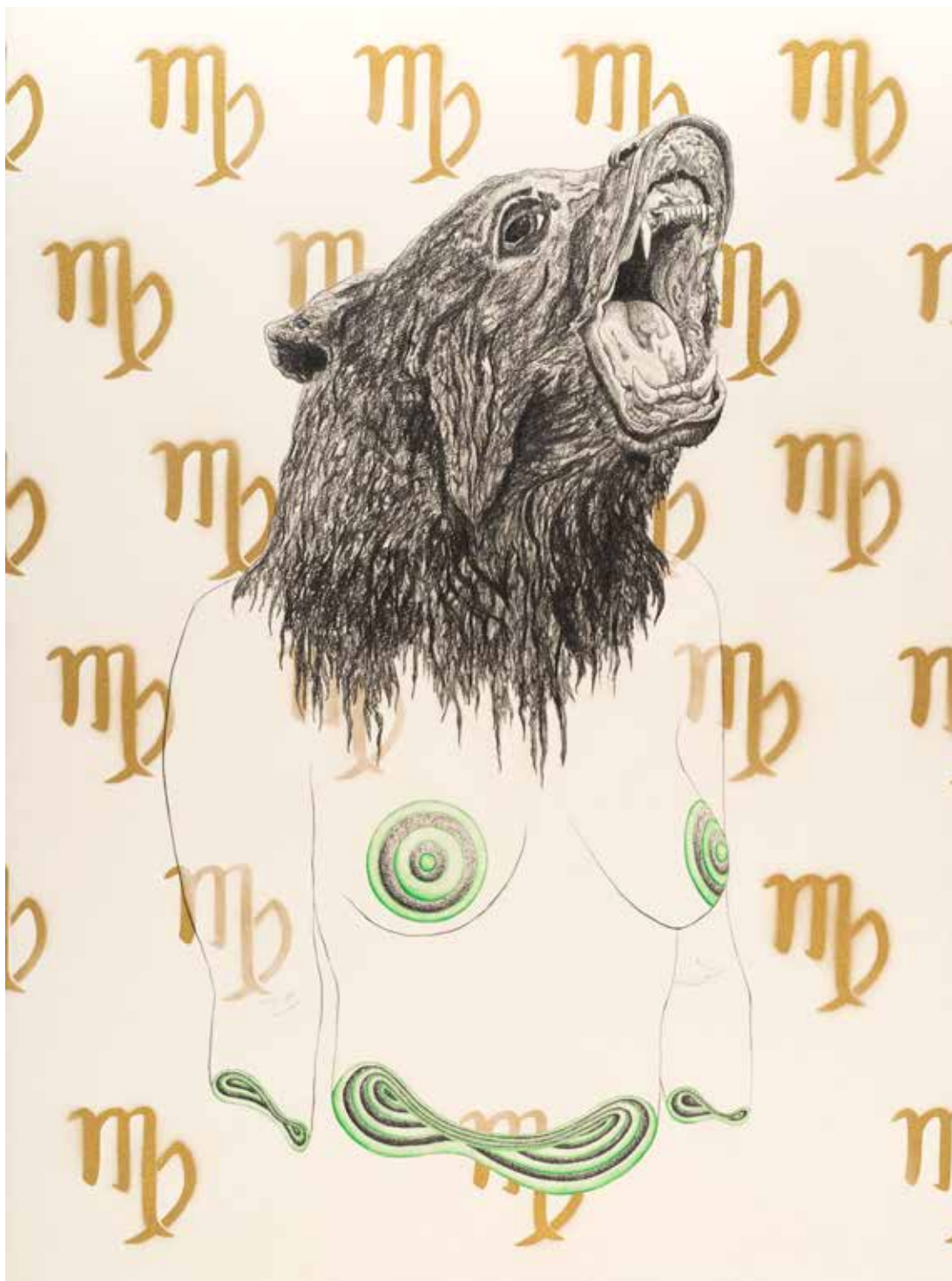
GRAPHITE, WATERCOLOR PENCIL, 30" X 22"