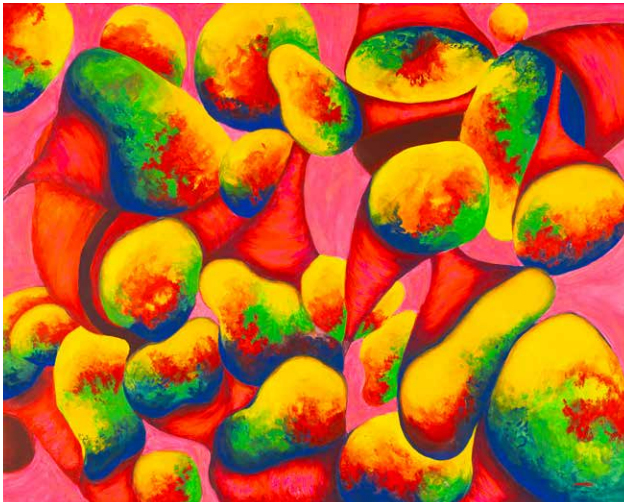
ACRYLIC ON CANVAS, 24" X 30"