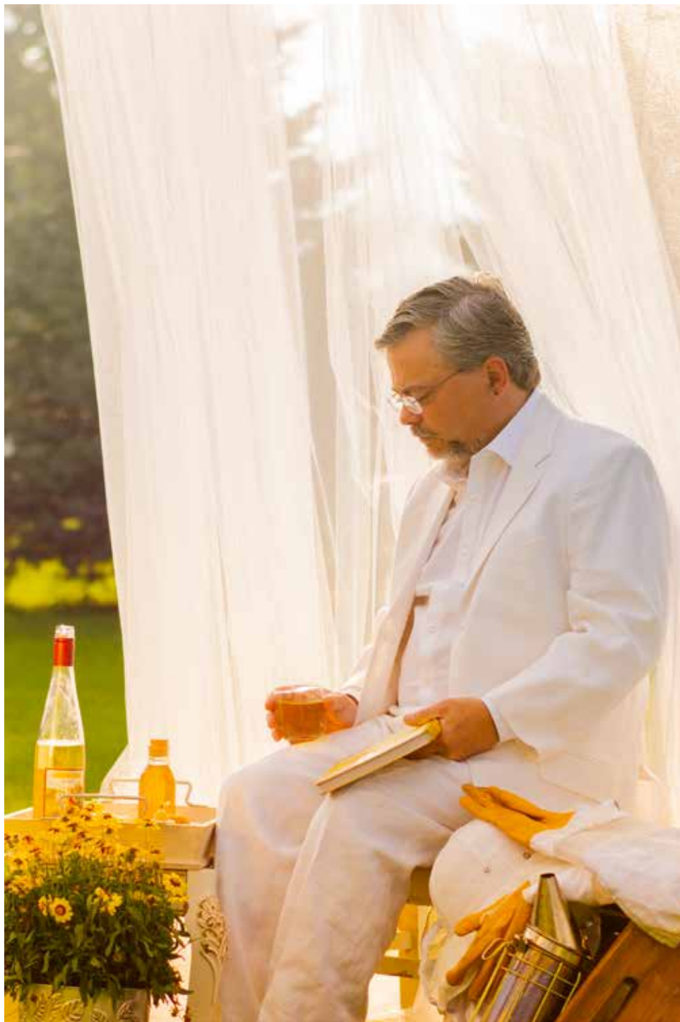
ARCHIVAL INKJET PRINT, 11" X 17"