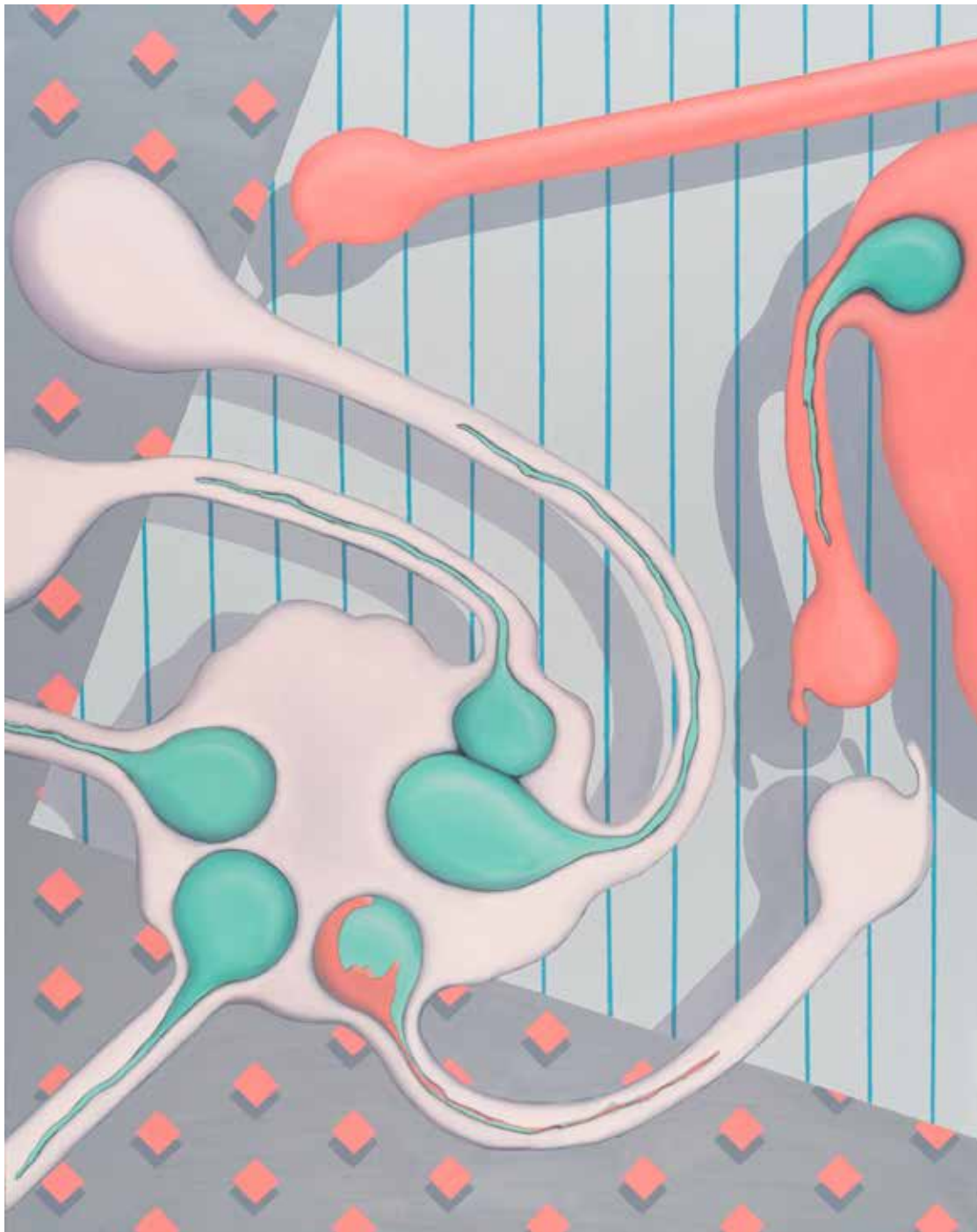
OIL ON CANVAS, 38" X 30"