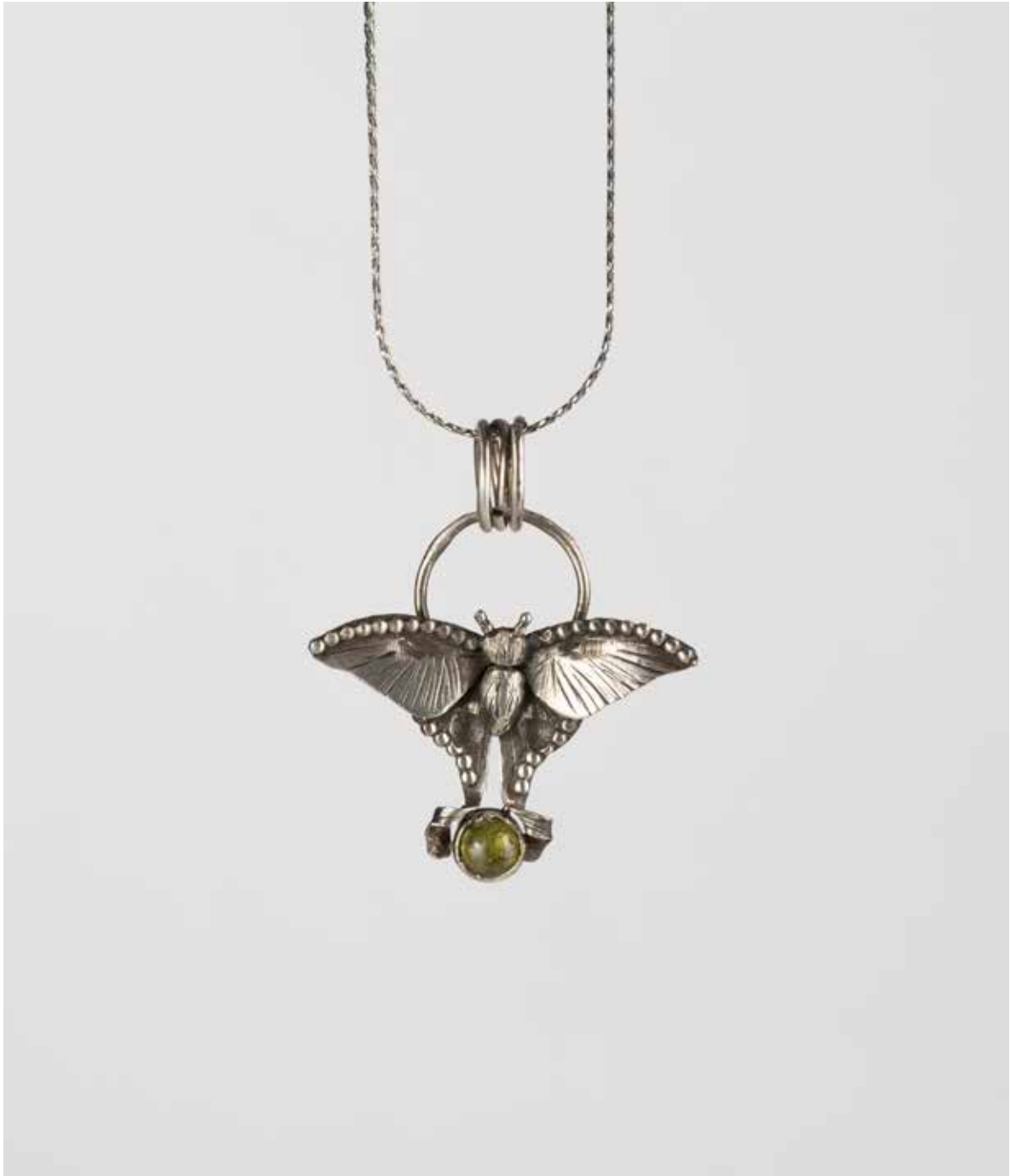
STERLING SILVER, 1.25" X 1.181" X .157"