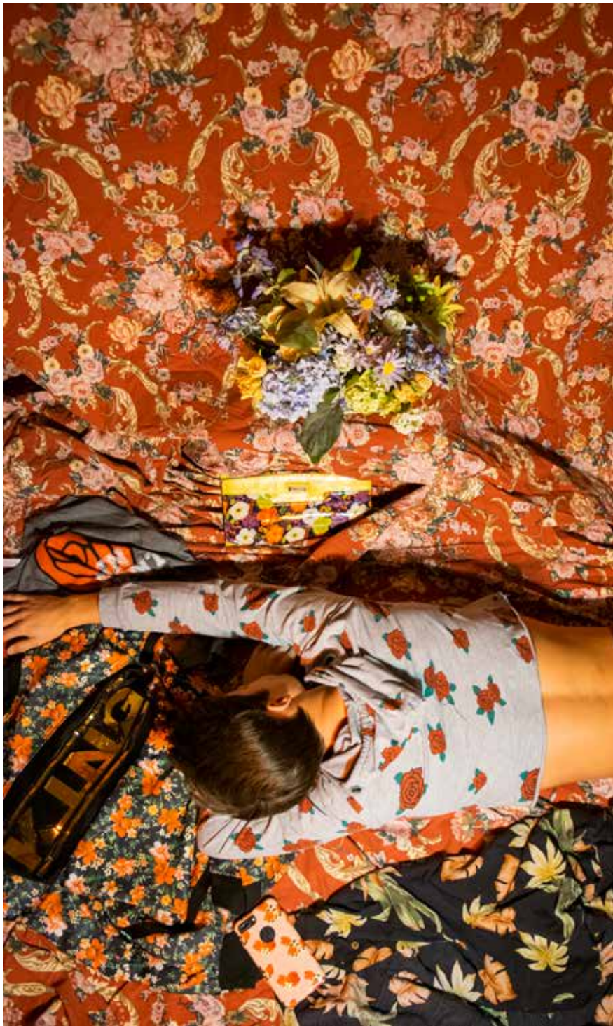
ARCHIVAL INKJET PRINT, 17" X 11"