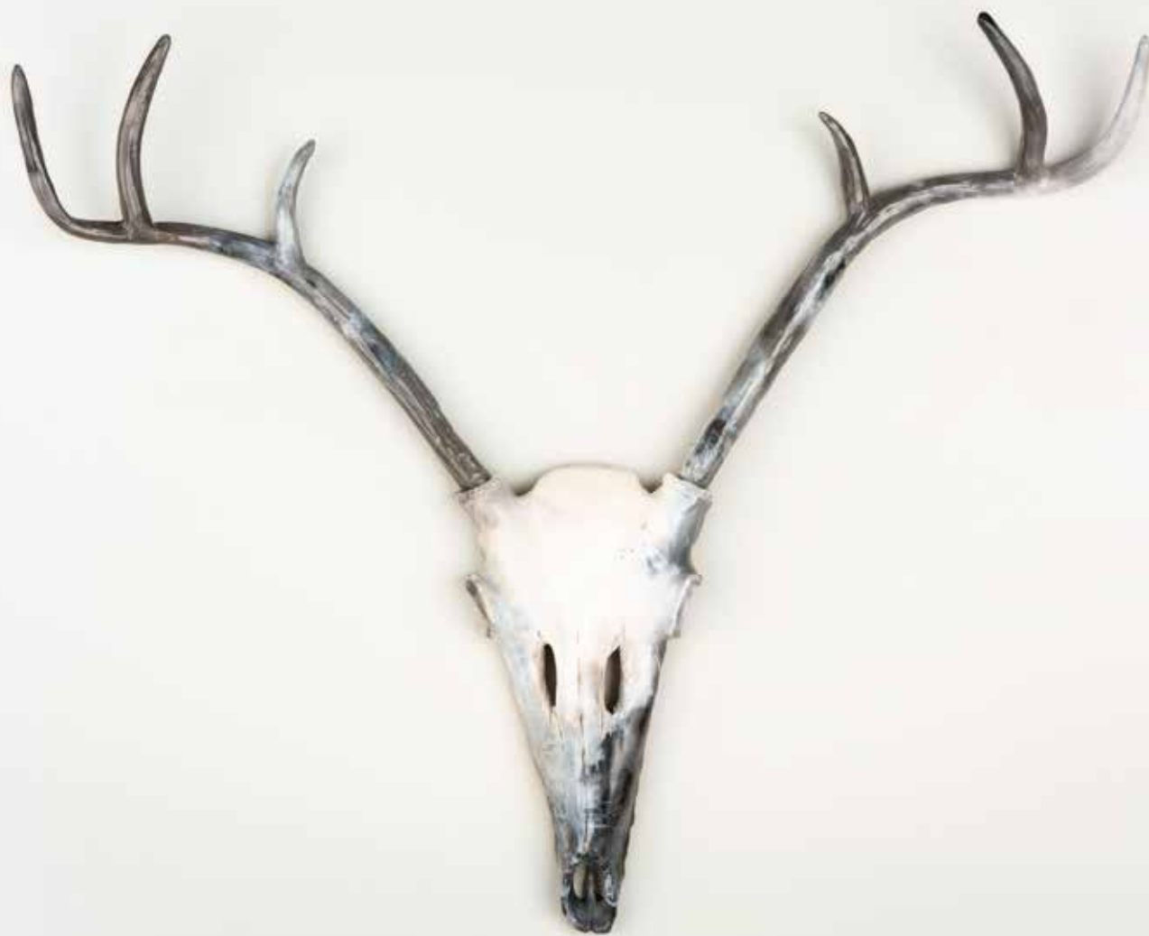
STONEWARE, 27" X 28" X 4"