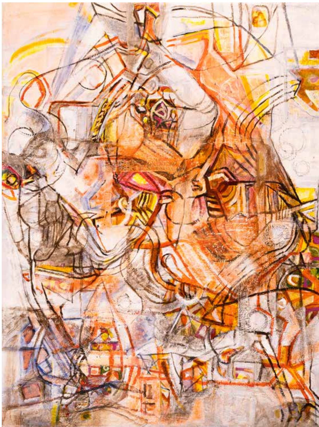
ACRYLIC ON CANVAS, 24" X 18"